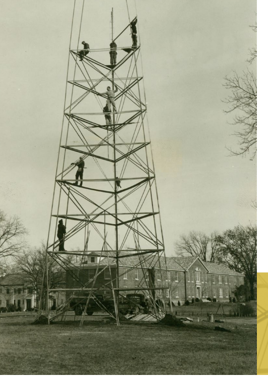
As illustrated in this old USC&GS photograph, building a tower back then was no different than the true reenactment of tower building in 2013. The design of a tower proved so successful, it underwent very few changes in its nearly 60 years of service.